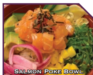
SALMON POKE BOWL