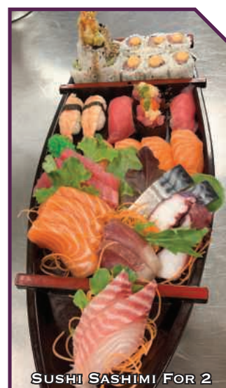
SUSHI SASHIMI FOR 2