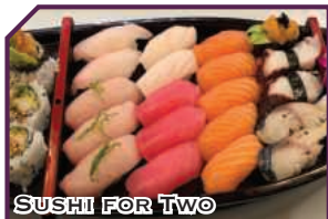
SUSHI FOR TWO