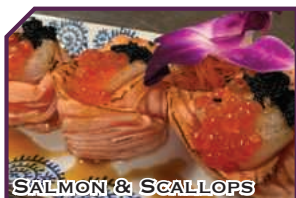
SALMON & SCALLOPS

Tuna, crab stick, avocado, cucumber, seaweed salad, tobiko, tempura crunch, spicy mayo & teriyaki sauce.